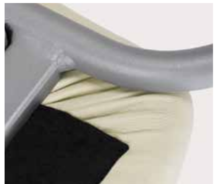
All upholstery staples are concealed