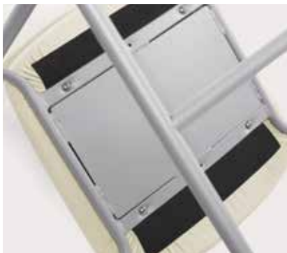
Steel seat pan increases weight and durability