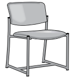
Heavy-Duty Chair, Bariatric 26" seat width