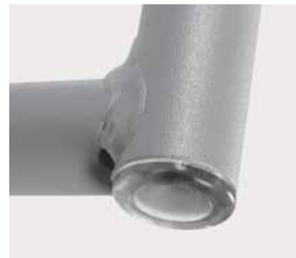
Non-removable glides are non-marring to protect floors from damage