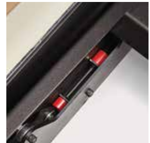
Proprietary mechanism is extremely durable and eliminates pinch points