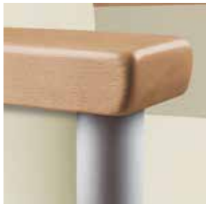
Armcap features large handgrip for easy ingress and egress