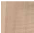
Hardrock Maple (HM)