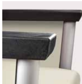
Arm caps available in 4 material types