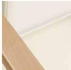
Clean-out space between seat and back allows for easy cleaning