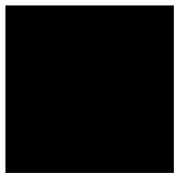
Smooth Black (SB)