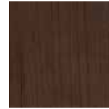
Cherry Blossom (CB)