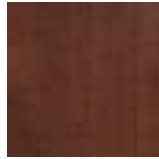
Summer Flame (SF)