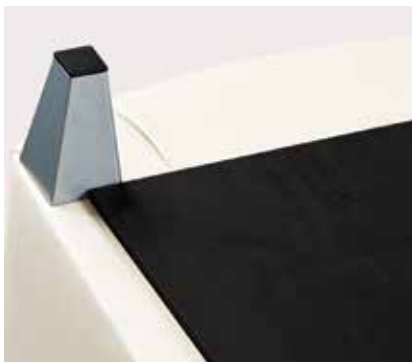
Underside plate conceals staples and prevents legs from being removed