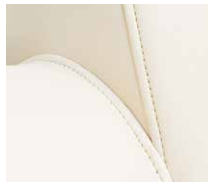
Attention to detail is evident in superb craftsmanship