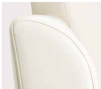
Arms designed to deter mishandling of the chair