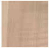
Hardrock Maple (HM)