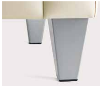
Leg available in choice of wood or metal