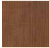
Rustic Cherry (RC)