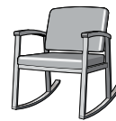
Rocker Chair Open Arms (24" seat)