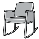
Rocker Chair Closed Arms (24" seat)