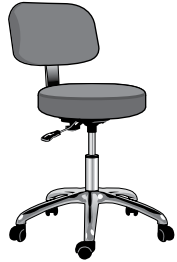
Model No. S1260 Physicians stool with back support no foot ring Seat Width 16 Seat Depth 16 Seat Height 18-23 Base Diameter 23