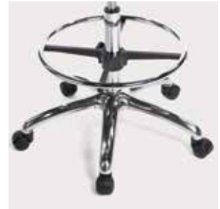
Height-adjustable foot ring (all models)

Vinyl selection: (*vinyls shown below are Grade 1. Refer to fabric guide chart in price list for many more fabric/vinyl choices)