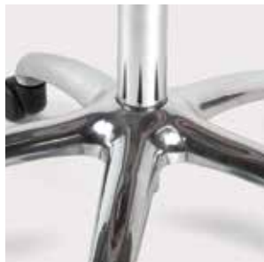
Die-cast aluminum base