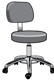
Model No. S1260-F Physicians stool with back support and foot-activated height adjustment Seat Width 16 Seat Depth 16 Seat Height 18.5-24 Base Diameter 23