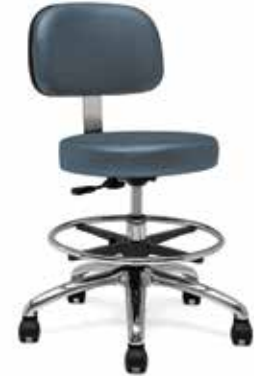
Bertram stool with foot ring and back support model 1280