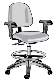
Model No. S1500-WA Upholstered Laboratory stool with arms Seat Width 18.5 Seat Depth 17 Seat Height 23-33 Base Diameter 27