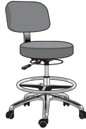
Model No. S1280 Physicians stool with foot ring and back support Seat Width 16 Seat Depth 16 Seat Height 18-23 Base Diameter 23