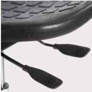
Seat height and back tilt levers (all models)