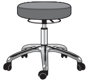
Model No. S1200 Physicians stool Seat Width 16 Seat Depth 16 Seat Height 18-23 Base Diameter 23