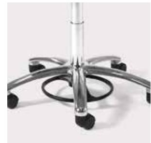
Optional foot-activated height-adjustment mechanism

Vinyl selection: (*vinyls shown below are Grade 1. Refer to fabric guide chart in price list for many more fabric/vinyl choices)