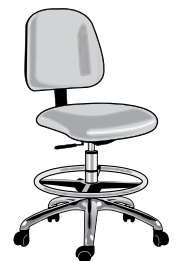
Model No. S1500 Upholstered Laboratory stool Seat Width 18.5 Seat Depth 17 Seat Height 23-33 Base Diameter 27