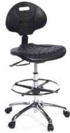
Bertram stool with foot ring model S1600