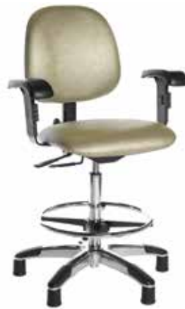
Bertram stool with foot ring and back support model S1500-WA