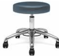
Bertram stool with foot-activated height adjustment model 1200-F