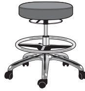
Model No. S1240 Physicians stool with foot ring Seat Width 16 Seat Depth 16 Seat Height 18-23 Base Diameter 23