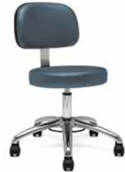
Bertram stool with back support and foot-activated height adjustment model 1260-F