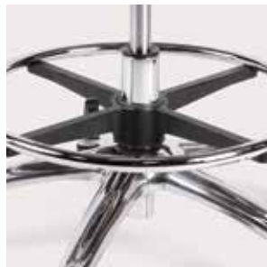
Height-adjustable foot ring