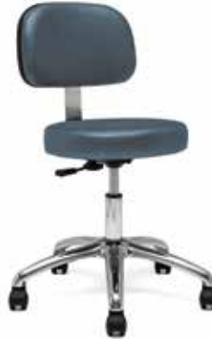
Bertram stool with back support model 1260