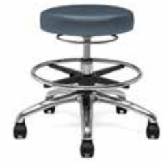
Bertram stool with foot ring model 1240