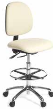
Bertram stool model S1500