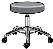
Model No. S1200-F Physicians stool with foot-activated height adjustment Seat Width 16 Seat Depth 16 Seat Height 18.5-24 Base Diameter 23