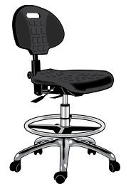
Model No. S1600 Polyurethane Laboratory stool Seat Width 18.5 Seat Depth 16.5 Seat Height 23-33 Base Diameter 27