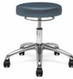
Bertram stool model 1200