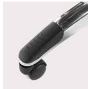
Optional "toe-cap" base available