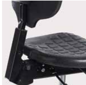
Adjustable back height mechanism (all models)