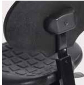
Rugged polyurethane seat and back (model S1600)