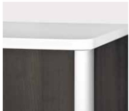
Cabinet tops are 1" thick and flush-mounted to inhibit handling Available in solid surface