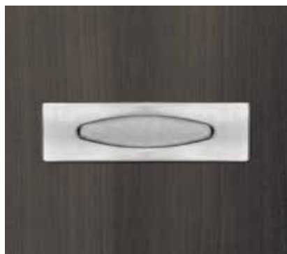
Anti-ligature features include inset pulls, continuous hinges and J-Bar in wardrobe