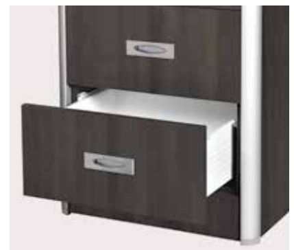
All drawers are non-removable without a special tool