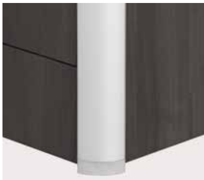
Aluminum leg features a custom fit glide that is non-removeable