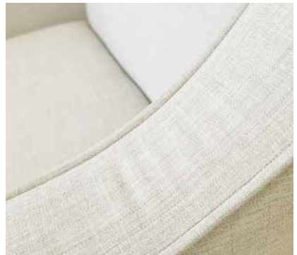
Attention to detail is evident in superb craftsmanship