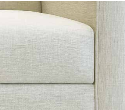
Seat cover features seamless front for increased durability