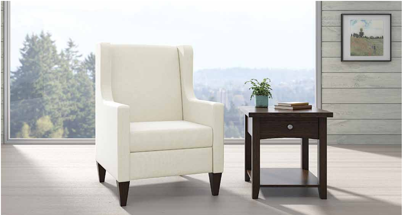
Avalon lounge chair with Chocolate leg finish

Lounge chair W 28 D 31 H 41 Seat H 19 Seat W 21.5