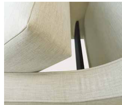
Removable seat deck enables ease of cleaning