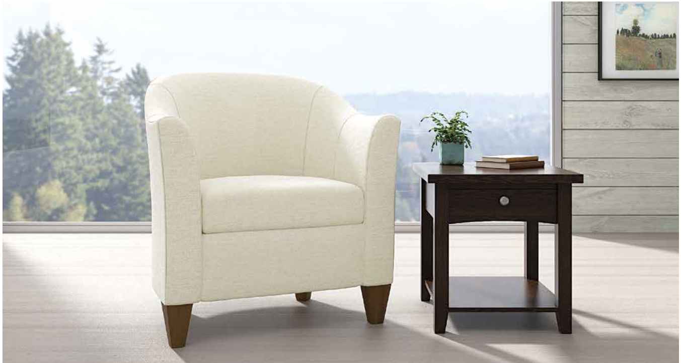
Charleston chair with Rustic Cherry leg finish

Tub chair W 31 D 28 H 31.5 Seat H 18 Seat W 20