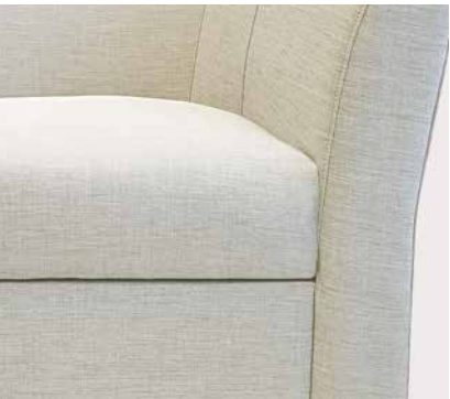
Seat cover features seamless front for increased durability