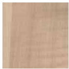
Hardrock Maple (HM)