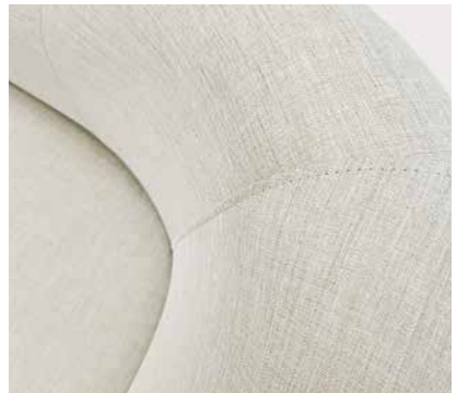
Attention to detail is evident in superb craftsmanship