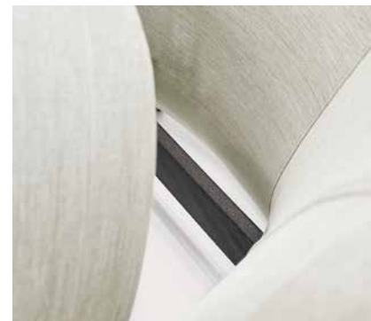
Removable seat deck enables ease of cleaning