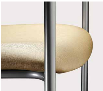
“Waterfall” front edge design enhances comfort and eliminates a potential pinch point.