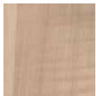
Hardrock Maple (HM)