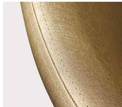
Double-stitch method increases durability and provides a cleaner appearance