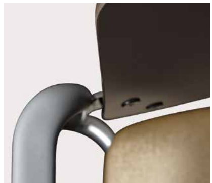
Chair design allows for easy cleaning and eliminates potential bacteria traps.