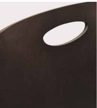
Backrest available in three unique cut-out designs. Custom cut-outs also available.