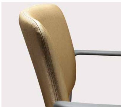
Compound-curved back provides a snug fit