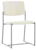
Heavy-Duty Chair W 20 D 21 H 32.5 Seat H 18 Seat W 18.5 Seat D 17