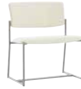
Heavy-Duty Chair, Bariatric W 23.5 D 21 H 32.5 Seat H 18 Seat W 22 Seat D 17