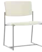
Heavy-Duty Chair, Mid-size W 23.5 D 21 H 32.5 Seat H 18 Seat W 22 Seat D 17