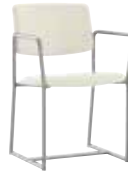
Heavy-Duty Chair, with arms W 22 D 21 H 32.5 Seat H 18 Seat W 18.5 Seat D 17