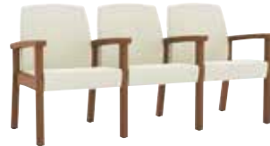
3 seater, center full arms W 71 D 27 H 34.5 Seat H 18.5 Seat W 21 Arm H 26