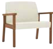
Bariatric single chair W 35.5 D 27 H 34.5 Seat H 18.5 Seat W 31 Arm H 26