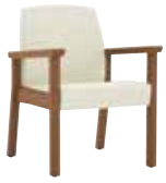
Single seat with arms W 25.5 D 27 H 34.5 Seat H 18.5 Seat W 21 Arm H 26