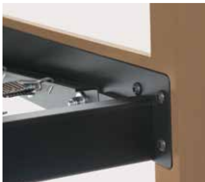
Superior construction methods and materials make the Boardwalk line one of the most durable on the market