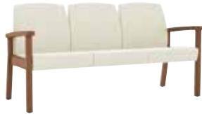
3 seater, no center arms W 68 D 27 H 34.5 Seat H 18.5 Seat W 21 Arm H 26