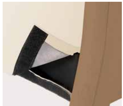
Seat and back upholstery is field-replaceable