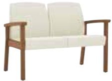
2 seater, no center arm W 46.75 D 27 H 34.5 Seat H 18.5 Seat W 21 Arm H 26