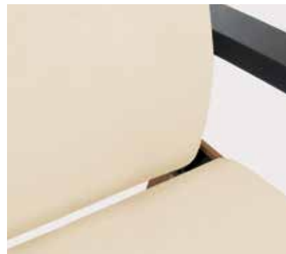
Ample clean-out spacing between seat and back