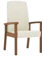
Highback single chair W 25.5 D 27 H 44.5 Seat H 18.5 Seat W 21 Arm H 26