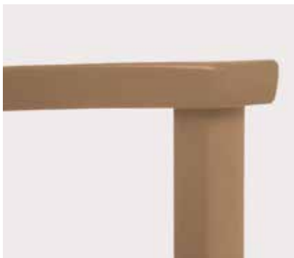
Large armcap designed for easy ingress and egress