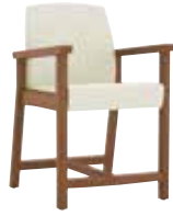
Hip chair W 25.5 D 27 H 40.5 Seat H 24.5 Seat W 21 Arm H 26