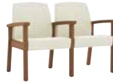
2 seater, center full arm W 48.25 D 27 H 34.5 Seat H 18.5 Seat W 21 Arm H 26