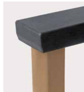
Field-replaceable black poly arm cap