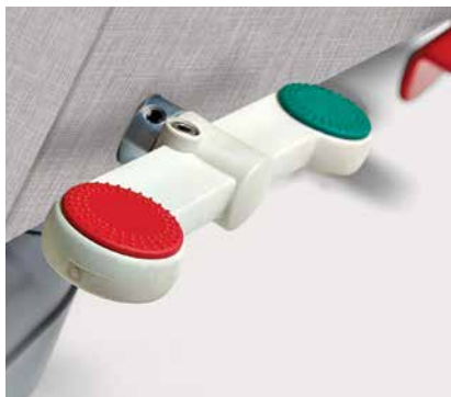
Optional "Central Locking System" allows all four casters to lock simultaneously