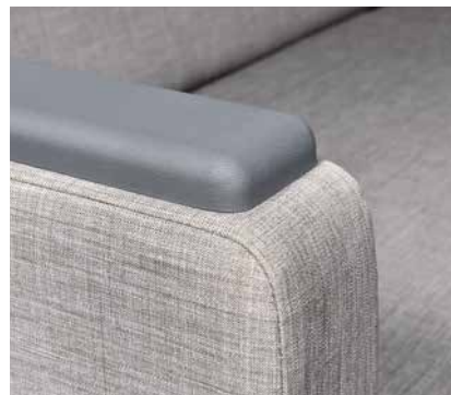
Optional arm caps available in wood, rigid polyester or solid surface