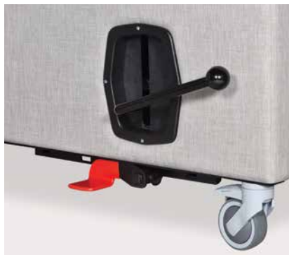
Side lever positioning permits both caregiver and patient to operate foot rest