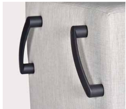
Ergonomically-positioned push handles