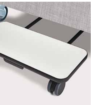
Optional slide out foot rest