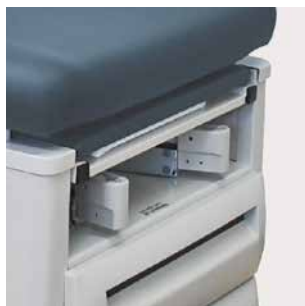
Slide-out leg extension and 4-position stirrups