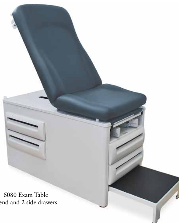
6080 Exam Table 2 end and 2 side drawers