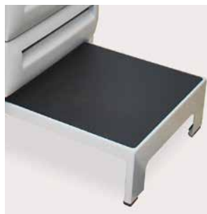
Slide-out foot stool for increased patient accessibility