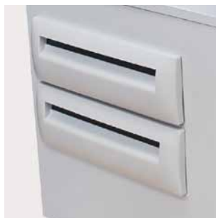
2 end drawers and 2 side drawers provide ample storage space