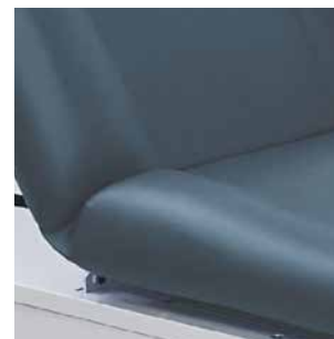
Replaceable top upholstered in seamless, easy-to-clean vinyl