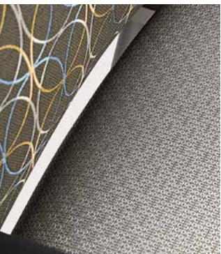
The clean-out spacing between seat and backrest ensures ease of cleaning