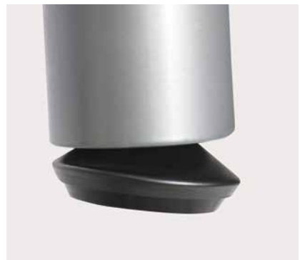
Optional adjustable glide is self-levelling to eliminate chair wobble on uneven surfaces