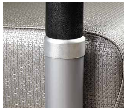
Aluminum transition ring adds strength and eliminates a potential bacteria trap