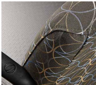
Attention to detail is evident in Integrity's superb craftsmanship