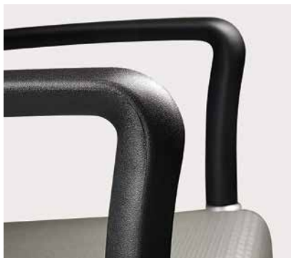
Soft, yet highly durable polyurethane arms are designed for easy ingress and egress