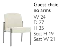
Guest chair, no arms W 24 D 27 H 35 Seat H 19 Seat W 21