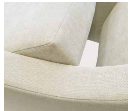
Removable seat deck enables ease of cleaning