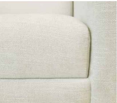
Seat cover features seamless front for increased durability