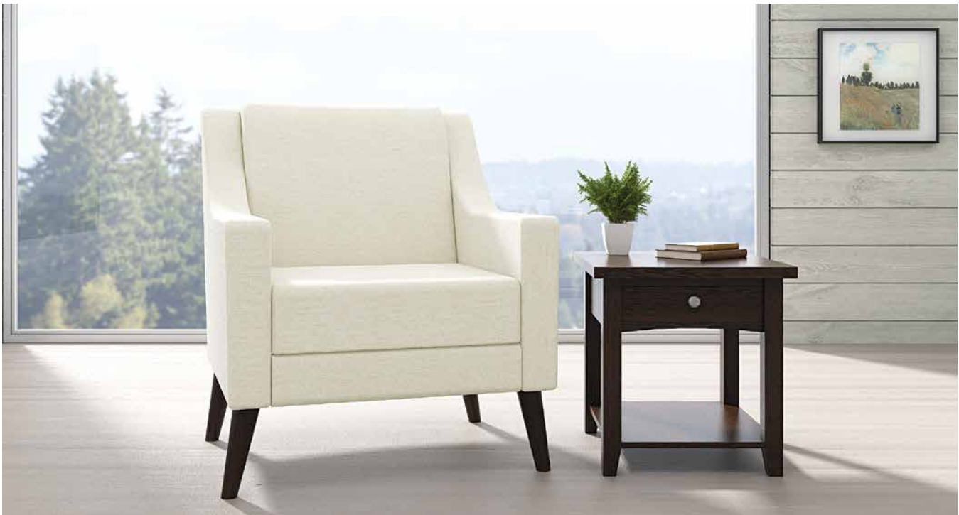
Kalarne lounge chair with Chocolate leg finish

Three seater W 70 D 32.5 H 34.5 Seat H 17.5 Seat W 20.5