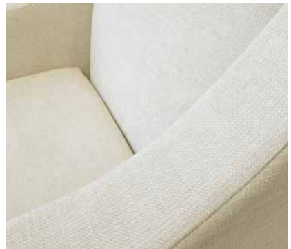
Attention to detail is evident in superb craftsmanship