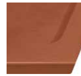
Spill Top (TSP)