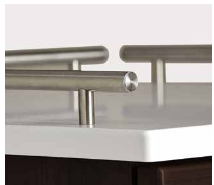
Many top styles and options available. Solid surface top with galley rails shown here