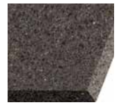
Solid Surface (TSS)