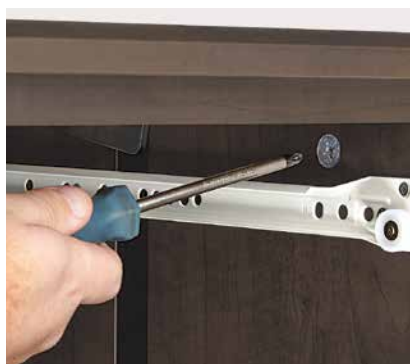
K-D fasteners allow tops to be easily replaced in the field. Doors and drawer fronts are also field-replaceable