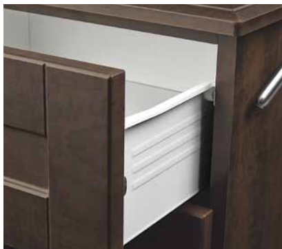
Powder-coated steel drawer sides covered by lifetime warranty