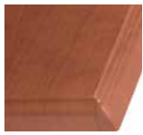
Santa Fe (TS)