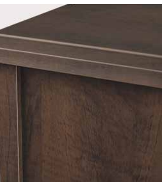
Solid matching backs provide superior structural integrity