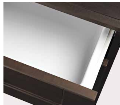
Optional drawer liner for bedside cabinet models is removable for cleaning purposes