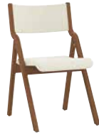
Kite Wood Folding Chair with upholstered back Model No. KT300-UPB W 19 D 22.75 H 32 Seat H 18 Seat W 16.25 Weight 16