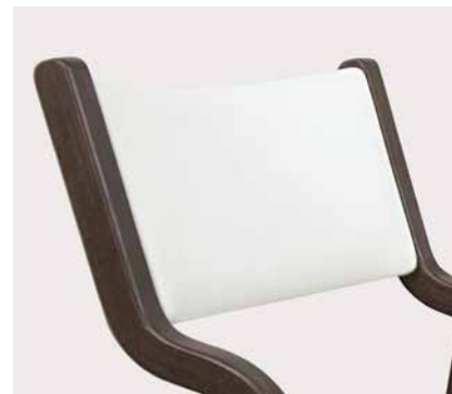
Contoured seat and back cushions provide ergonomic comfort