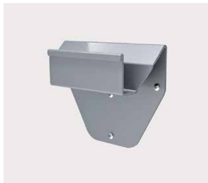
Bracket allows chair to mount tightly against the wall