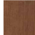
Rustic Cherry (RC)