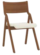
Kite Wood Folding Chair with wood back Model No. KT300-WDB W 19 D 22.75 H 32 Seat H 18 Seat W 16.25 Weight 16