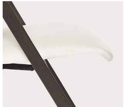
Waterfall seat design provides comfortable sit