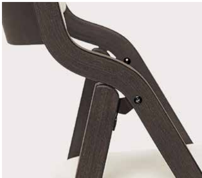
Frame design eliminates pinch points and risk of chair folding unintentionally