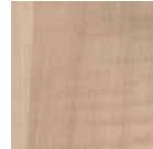
Hardrock Maple (HM)