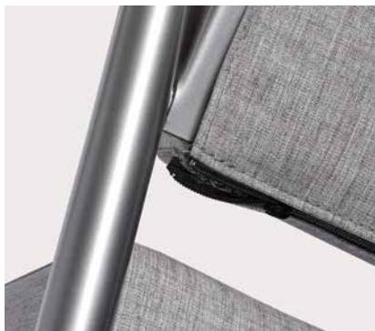
Seat, back and arms can be replaced if necessary