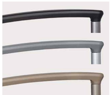
Heavy-duty arm is available in 3 colors