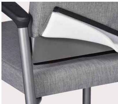
Fully welded 14-gauge powder-coated steel frame with reinforced back bar