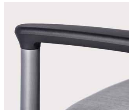
Arm designed to assist with ingress and egress