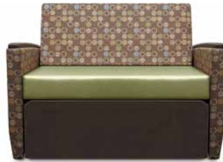
2 person sofa