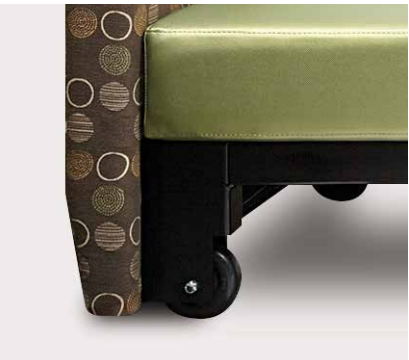
Boasts ultra-durable steel frame construction and long lasting neoprene wheels