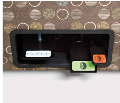
Easy-access foot activators allow ease of mobility and eliminate care-giver strain