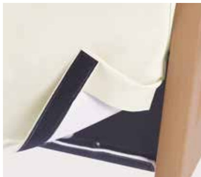
Field-replaceable seat and back upholstery