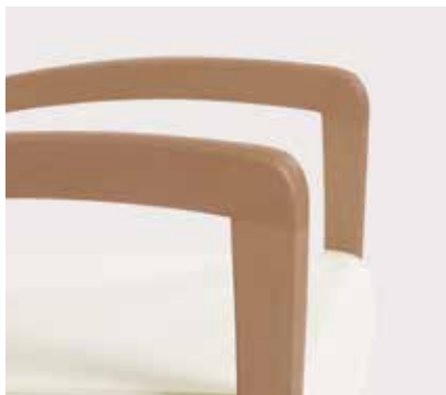
Extended arms feature contoured handgrips for easy ingress and egress