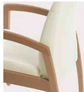
Wall saver rear leg design