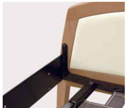
Durable metal seat frame construction