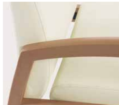
Ample clean-out spacing between seat and back