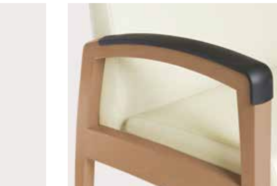
Optional polyurethane armpad available in three colours