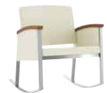
Rocker Chair Closed Arms (24" seat)