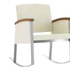
Rocker Chair Closed Arms (21" seat)