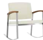
Rocker Chair Open Arms (24" seat)