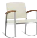
Rocker Chair Open Arms (21" seat)