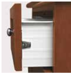
Powder-coated steel drawer sides covered by lifetime warranty