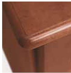
Hardwood bullnose edging ensures durability and safer, softer edges