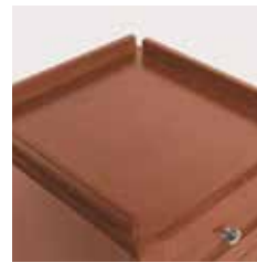
Optional galley rail available on all bedside table models