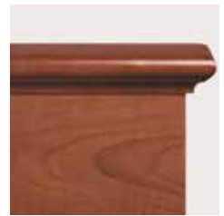
Head/Foot Boards feature solid maple decorative top rail