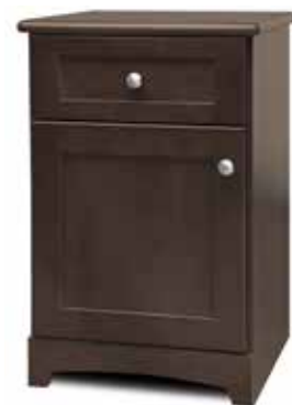
Drawer/door bedside table with interior fixed shelf shown in Chocolate finish