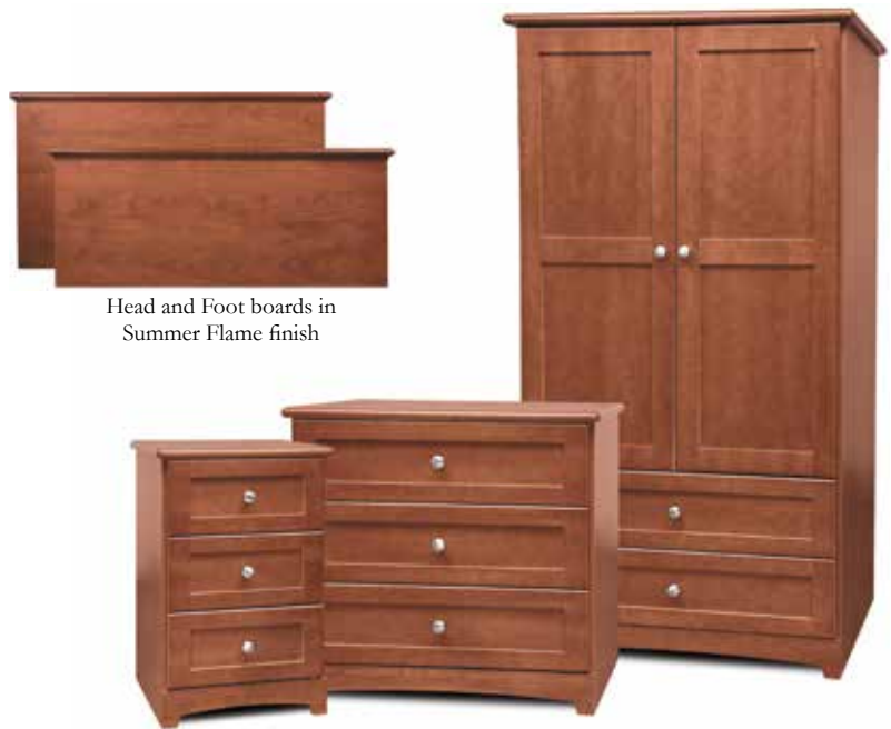
Head and Foot boards in Summer Flame finish

Doors and drawer fronts feature solid maple "frames" with 1/4" thick veneer insert panel. Cabinet sides and back sides are 3/4" thickness, surfaced with matching laminate.