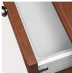
Optional drawer liner available for all bedside cabinet models