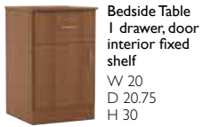
Bedside Table 1 drawer, door interior fixed shelf W 20 D 20.75 H 30