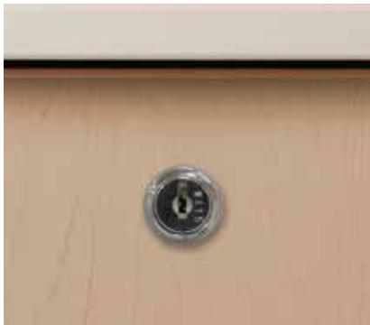
Optional drawer lock may be specified on any Royale cabinet