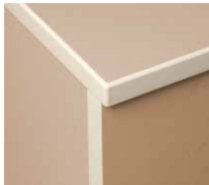
Solid matching backs provide superior structural integrity