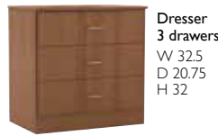
Dresser 3 drawers W 32.5 D 20.75 H 32