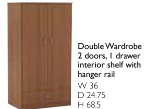
Double Wardrobe 2 doors, 1 drawer interior shelf with hanger rail W 36 D 24.75 H 68.5