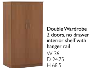
Double Wardrobe 2 doors, no drawer interior shelf with hanger rail W 36 D 24.75 H 68.5