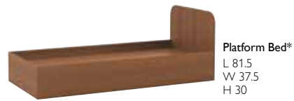
Platform Bed* L 81.5 W 37.5 H 30

*Available with or without behavioral health mattress