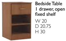
Bedside Table 1 drawer, open fixed shelf W 20 D 20.75 H 30