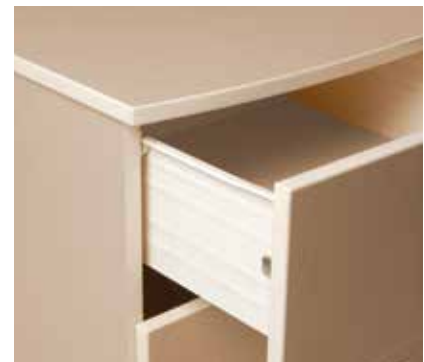
Powder-coated steel drawer sides covered by lifetime warranty