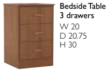
Bedside Table 3 drawers W 20 D 20.75 H 30