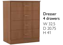
Dresser 4 drawers W 32.5 D 20.75 H 41