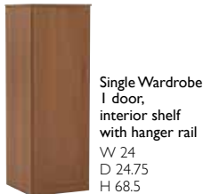
Single Wardrobe 1 door, interior shelf with hanger rail W 24 D 24.75 H 68.5