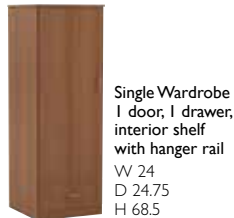
Single Wardrobe 1 door, 1 drawer, interior shelf with hanger rail W 24 D 24.75 H 68.5