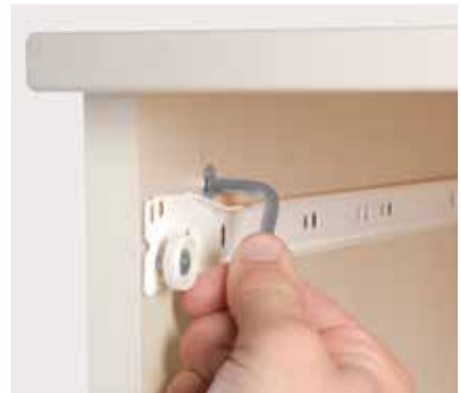
K-D fasteners allow tops to be easily replaced in the field