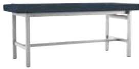
Treatment table W 71 D 28 H 30