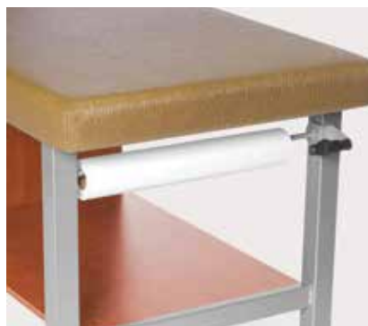
Proprietary "quick-change" paper holder