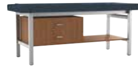
Treatment table with shelf and drawer unit W 71 D 28 H 30

* Optional adjustable head rest available for each model