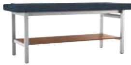
Treatment table with shelf W 71 D 28 H 30