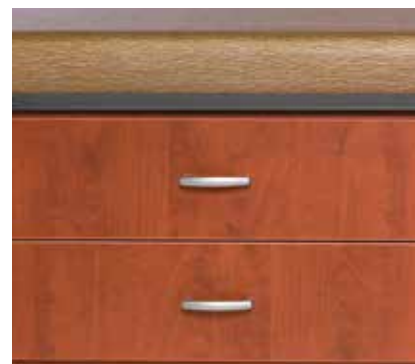
Optional drawer unit provides ample storage