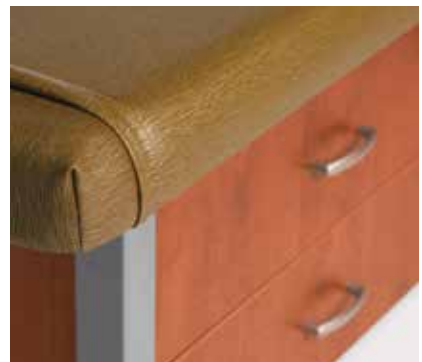
Available in many powdercoat, laminate and vinyl surfaces