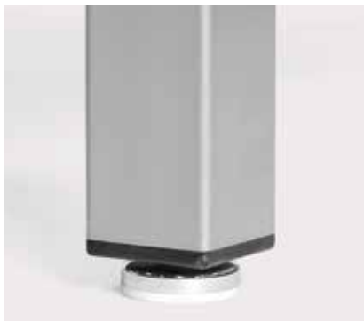
Adjustable levelling glides ensure a level surface in spite of uneven floors