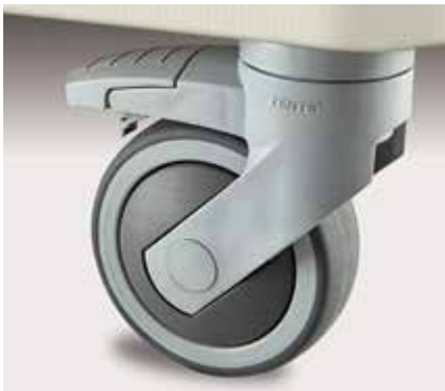
4 locking casters prohibit wheel from rolling or swiveling