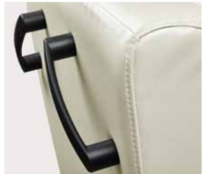
Ergonomically-positioned push handles