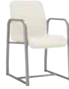
Heavy-Duty Chair, with arms and sled base 18" seat width W 18 D 25.5 H 35 Seat H 19