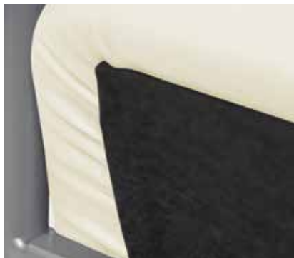
Concealed upholstery staples