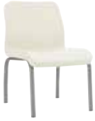
Heavy-Duty Chair, armless 4 post legs 22" seat width W 23.5 D 25.5 H 35 Seat H 19