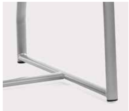
H-base adds additional reinforcement