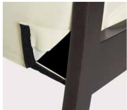
Seat and back upholstery covers are removable for easy cleaning or replacement