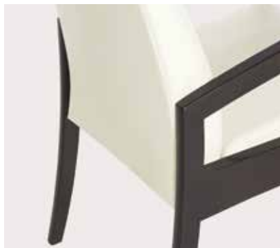
Wall saver rear leg design prevents damage to walls