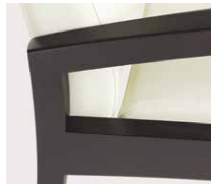
Ample spacing between seat and back enables easier cleaning