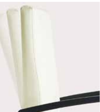
Optional flex-back available on guest and patient chair models