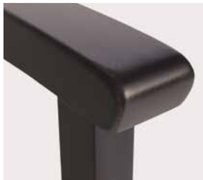
Extended arms feature contoured handgrips for easy ingress and egress