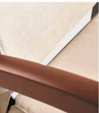
Space-through space between seat and back allows for easier cleaning