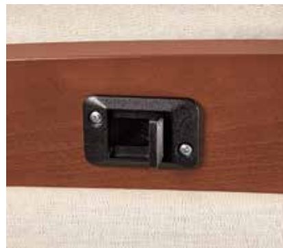
Reclining lever is ergonomically located for easy activation