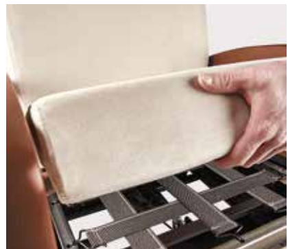
Seat and back upholstery covers are field-replaceable and easy to clean