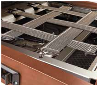
Nylon-webbed metal seat frame increases comfort and durability