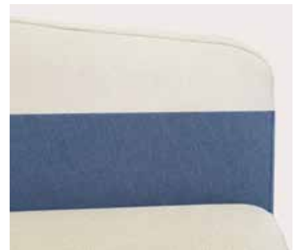
Contrasting fabric band is optional