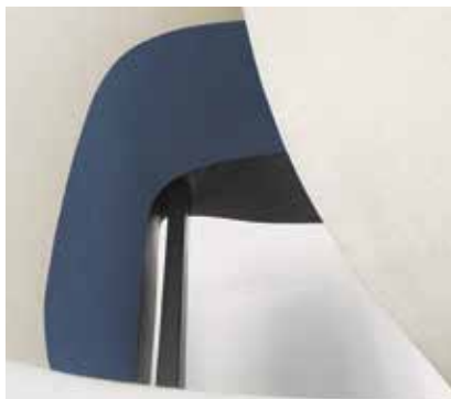
Removable seat deck with pass-through design for ease of cleaning