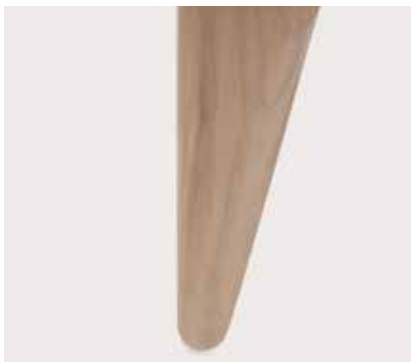
Shaped wood leg available in choice of 8 finishes