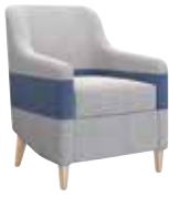
Single lounge W 28 D 28 H 36 Seat H 19 Seat W 20 Seat D 20 Arm H 25