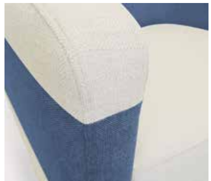
Quality Craftsmanship and superb attention to detail