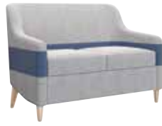
Two-seat lounge W 58 D 28 H 36 Seat H 19 Seat W 44 Seat D 20 Arm H 25