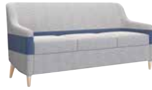
Three-seat lounge W 76 D 28 H 36 Seat H 19 Seat W 68 Seat D 20 Arm H 25