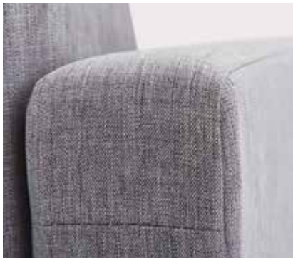
Attention to detail is evident in superb craftsmanship