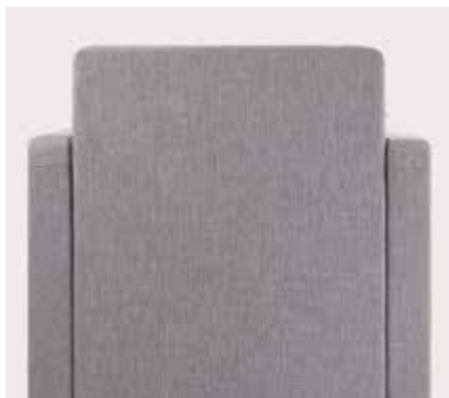
All fasteners are concealed