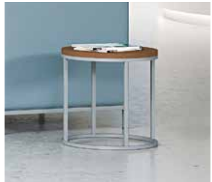
Coordinating side table available in various styles and sizes