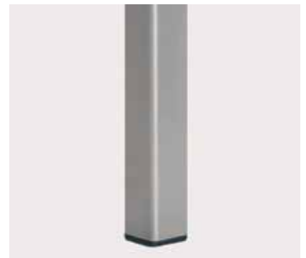
Heavy-duty, non-marring glides