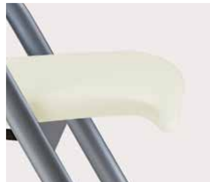
Waterfall seat design provides comfortable sit