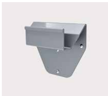
Bracket allows chair to mount tightly against the wall