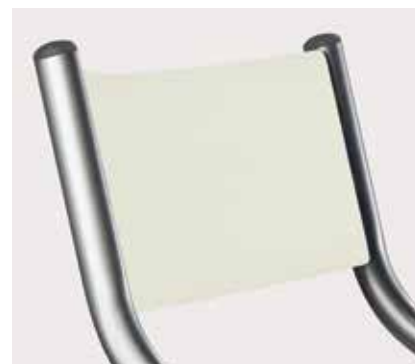
Contoured seat and back cushions provide ergonomic comfort