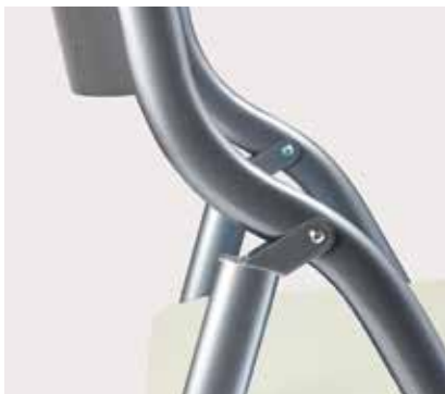
Frame design eliminates pinch points and risk of chair folding unintentionally