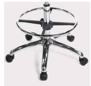
Height-adjustable foot ring (all models)

Vinyl selection: (*vinyls shown below are Grade 1. Refer to fabric guide chart in price list for many more fabric/vinyl choices)