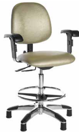
Bertram stool with foot ring and back support model S1500-WA