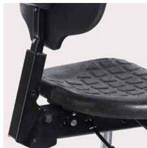
Adjustable back height mechanism (all models)