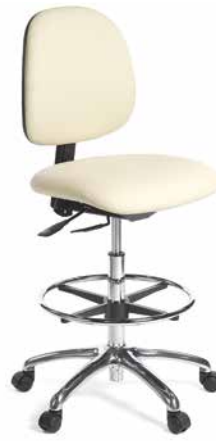
Bertram stool model S1500