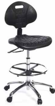
Bertram stool with foot ring model S1600