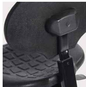
Rugged polyurethane seat and back (model S1600)