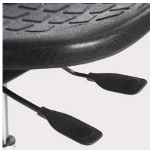
Seat height and back tilt levers (all models)