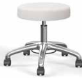
Model No. S1200-F Physician stool with foot-activated height adjustment Seat Width 16 Seat Depth 16 Seat Height 18.5-24 Base Diameter 23