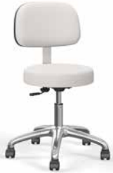
Model No. S1260 Physician stool with back support no foot ring Seat Width 16 Seat Depth 16 Seat Height 18-23 Base Diameter 23