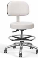
Model No. S1280 Physician stool with foot ring and back support Seat Width 16 Seat Depth 16 Seat Height 18-23 Base Diameter 23

Vinyl selection: (*vinyls shown below are Grade 1 “in-stock” vinyls. Refer to fabric guide chart in price list for many more fabric/vinyl choices)