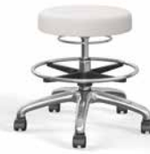
Model No. S1240 Physician stool with foot ring Seat Width 16 Seat Depth 16 Seat Height 18-23 Base Diameter 23