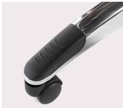
Optional "toe-cap" base available