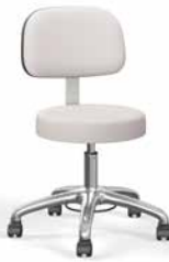
Model No. S1260-F Physician stool with back support and foot-activated height adjustment Seat Width 16 Seat Depth 16 Seat Height 18.5-24 Base Diameter 23