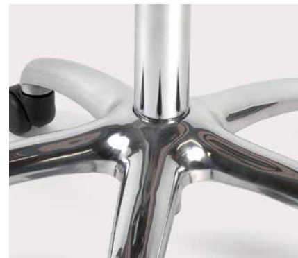
Die-cast aluminum base

Stance Healthcare seating products are Level Certified. To learn more, visit www.levelcertified.org .