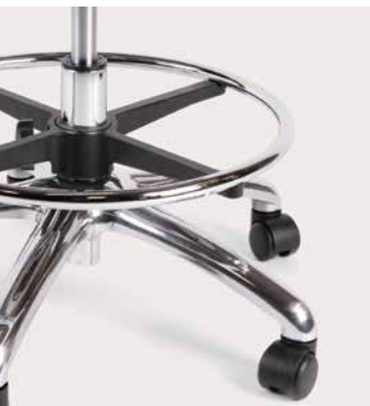
Height-adjustable foot ring