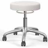
Model No. S1200 Physician stool Seat Width 16 Seat Depth 16 Seat Height 18-23 Base Diameter 23