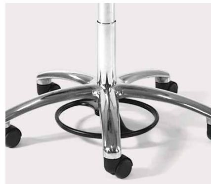
Optional foot-activated height-adjustment mechanism