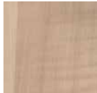
Hardrock Maple (HM)