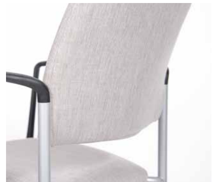
Back mounting brackets are fully concealed