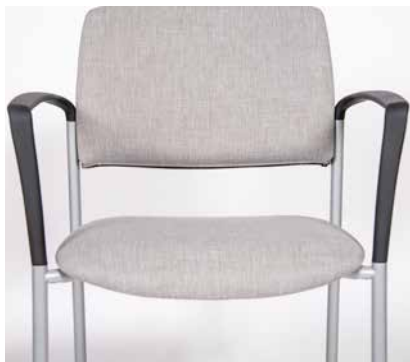
Clean-out space between seat and back