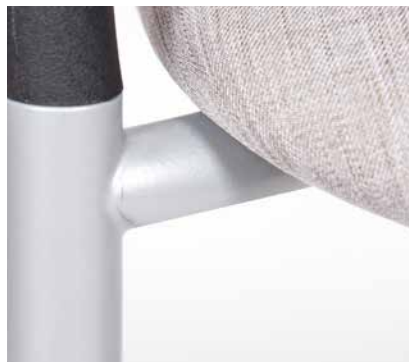
Brazed frame welds provide a clean aesthetic