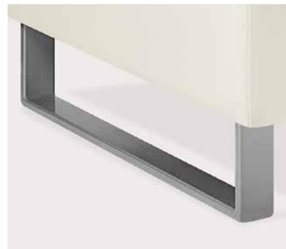
Contemporary sled base design enables bolt-to-floor option