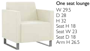
One seat lounge W 29.5 D 28 H 32 Seat H 18 Seat W 23 Seat D 18 Arm H 26.5