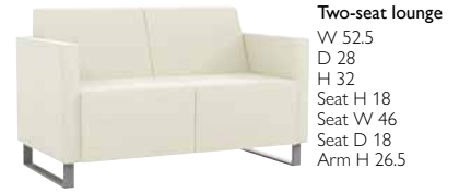
Two-seat lounge W 52.5 D 28 H 32 Seat H 18 Seat W 46 Seat D 18 Arm H 26.5