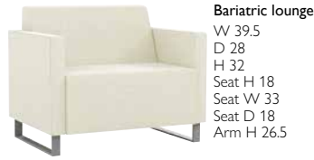
Bariatric lounge W 39.5 D 28 H 32 Seat H 18 Seat W 33 Seat D 18 Arm H 26.5