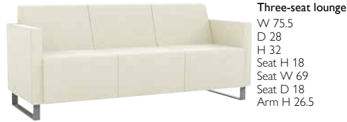
Three-seat lounge W 75.5 D 28 H 32 Seat H 18 Seat W 69 Seat D 18 Arm H 26.5