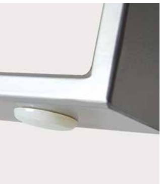
Low-profile nylon glide protects floors from damage