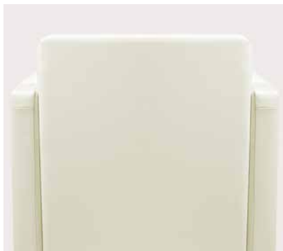
All fasteners are tamper-resistant and are concealed for added security