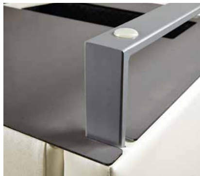
Steel seat pan conceals upholstery staples