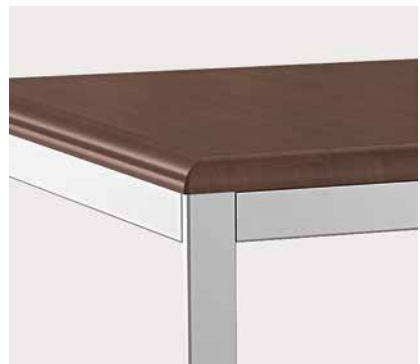
Tabletops feature rounded edges to reduce risk of injury