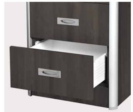
All drawers are non-removable without a special tool