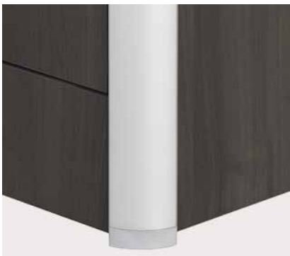
Aluminum leg features a custom fit glide that is non-removeable