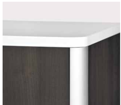
Cabinet tops are 1" thick and flush-mounted to inhibit handling Available in solid surface