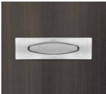
Ligature-resistant features include inset pulls, continuous hinges and J-Bar in wardrobe