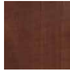
Summer Flame (SF)