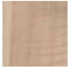
Hardrock Maple (HM)