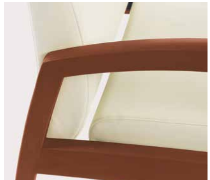
Separate seat and back for easy cleaning