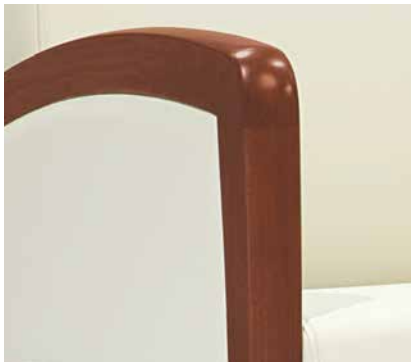
Closed arm panel available in upholstery or laminate