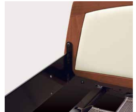
Inner steel seat frame adds weight and durability