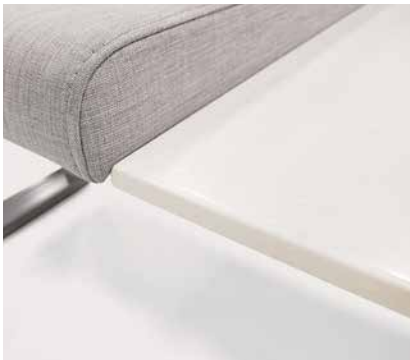
Optional solid surface center table