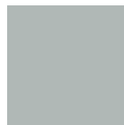
Smooth Silver (SS)