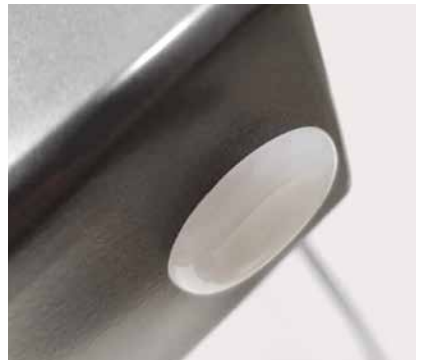
Non-removable nylon glides