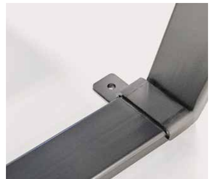
Optional floor mount brackets