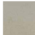
Metallic Beige (MB)