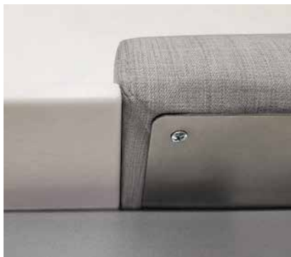
All upholstery staples are concealed