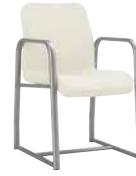
Heavy-Duty Chair, with arms and sled base 18" seat width W 18 D 25.5 H 35 Seat H 19