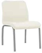
Heavy-Duty Chair, armless 4 post legs 22" seat width W 23.5 D 25.5 H 35 Seat H 19