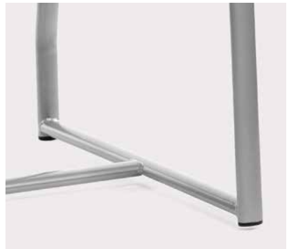
H-base adds additional reinforcement