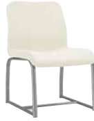
Heavy-Duty Chair, armless with sled base 22" seat width W 23.5 D 25.5 H 35 Seat H 19