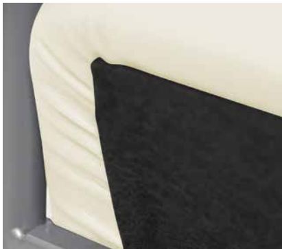
Concealed upholstery staples