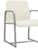
Heavy-Duty Chair, with arms and sled base 22" seat width W 23.5 D 25.5 H 35 Seat H 19