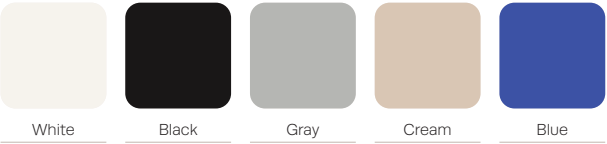
White Black Gray Cream Blue