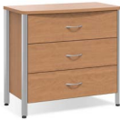
SG200 3-Drawer Dresser W 34 D 20 H 32