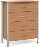
SG210 4-Drawer Dresser W 34 D 20 H 41