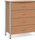
SG210 4-Drawer Dresser W 34 D 20 H 41