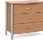
SG200 3-Drawer Dresser W 34 D 20 H 32