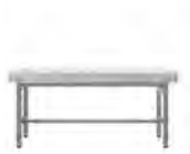
ST6085 Treatment Table W 72 D 28 H 30