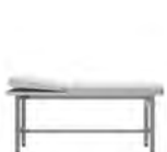
ST6085-ABR Treatment Table W 72 D 28 H 30