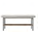
ST6085-SH Treatment Table, shelf W 72 D 28 H 30