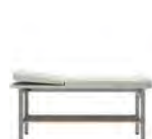
ST6085-SH-ABR Treatment Table, shelf W 72 D 28 H 30