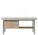
ST6085-DW Treatment Table, drawer W 72 D 28 H 30