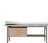
ST6085-DW-ABR Treatment Table, drawer W 72 D 28 H 30