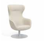
VAL121-SDB-HB Highback 21", swivel disc base W 20 D 21 H 32.5 Seat H 18 W 18.5 Arm H 24