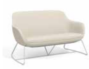
VAL147-WB Lounge Chair 47" W 56.5 D 30.75 H 31.25 Seat W 47 D 20 H 16.75 Arm H 24