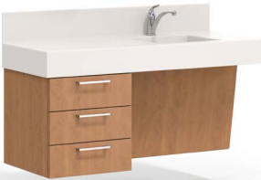
SVCSEB-B-R Small Exam Room B, right W 49 D 20 H 81