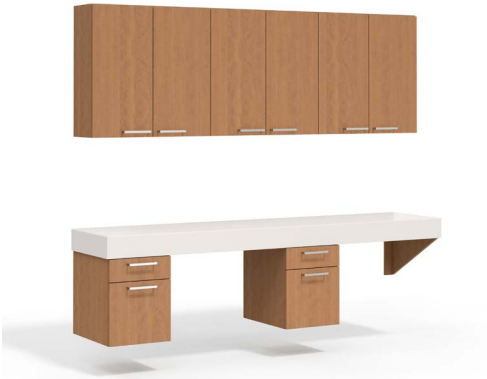
SVCDD-L Doctor's Dictation, left W 91 D 20 H 75