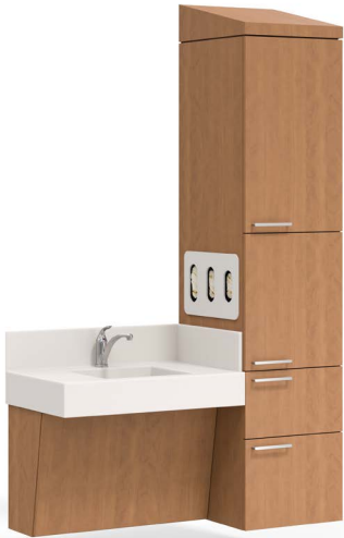
SVCSE-C-L Small Exam Room C, left W 48.5 D 20 H 81