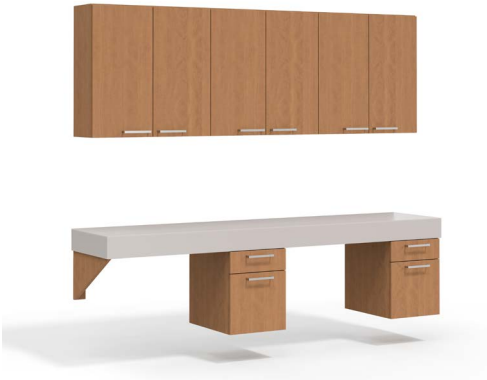
SVCDD-R Doctor's Dictation, right W 91 D 20 H 75