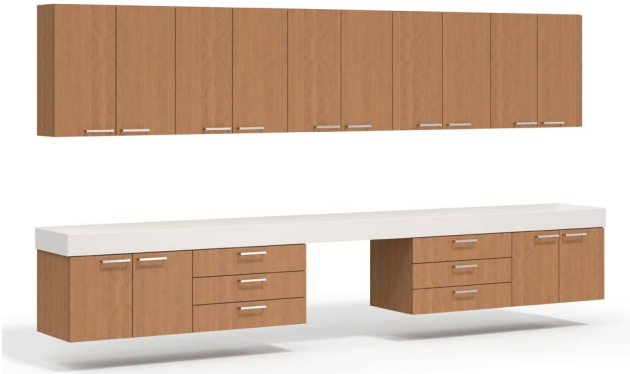
SVCWA Work Area W 151 D 20 H 75