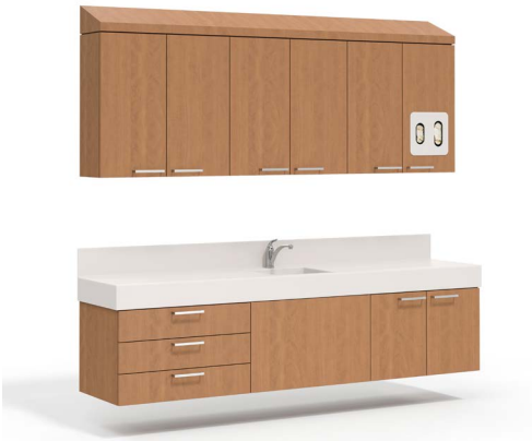
SVCPR-L Procedure Room, left W 91 D 20 H 81