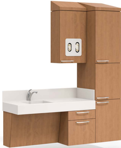
SVCMER-L Medium Exam Room, left W 66.5 D 20 H 81