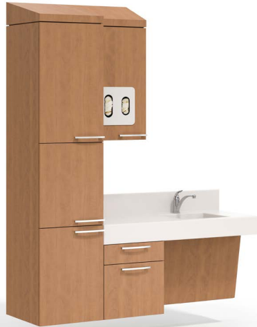
SVCMER-R Medium Exam Room, right W 66.5 D 20 H 81