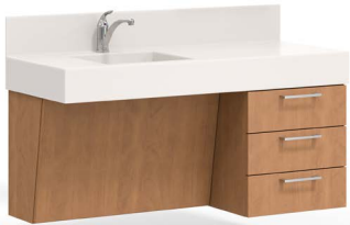
SVCSEB-B-L Small Exam Room B, left W 49 D 20 H 81