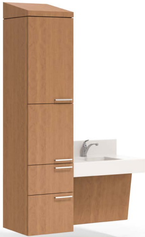
SVCSE-C-R Small Exam Room C, right W 48.5 D 20 H 81