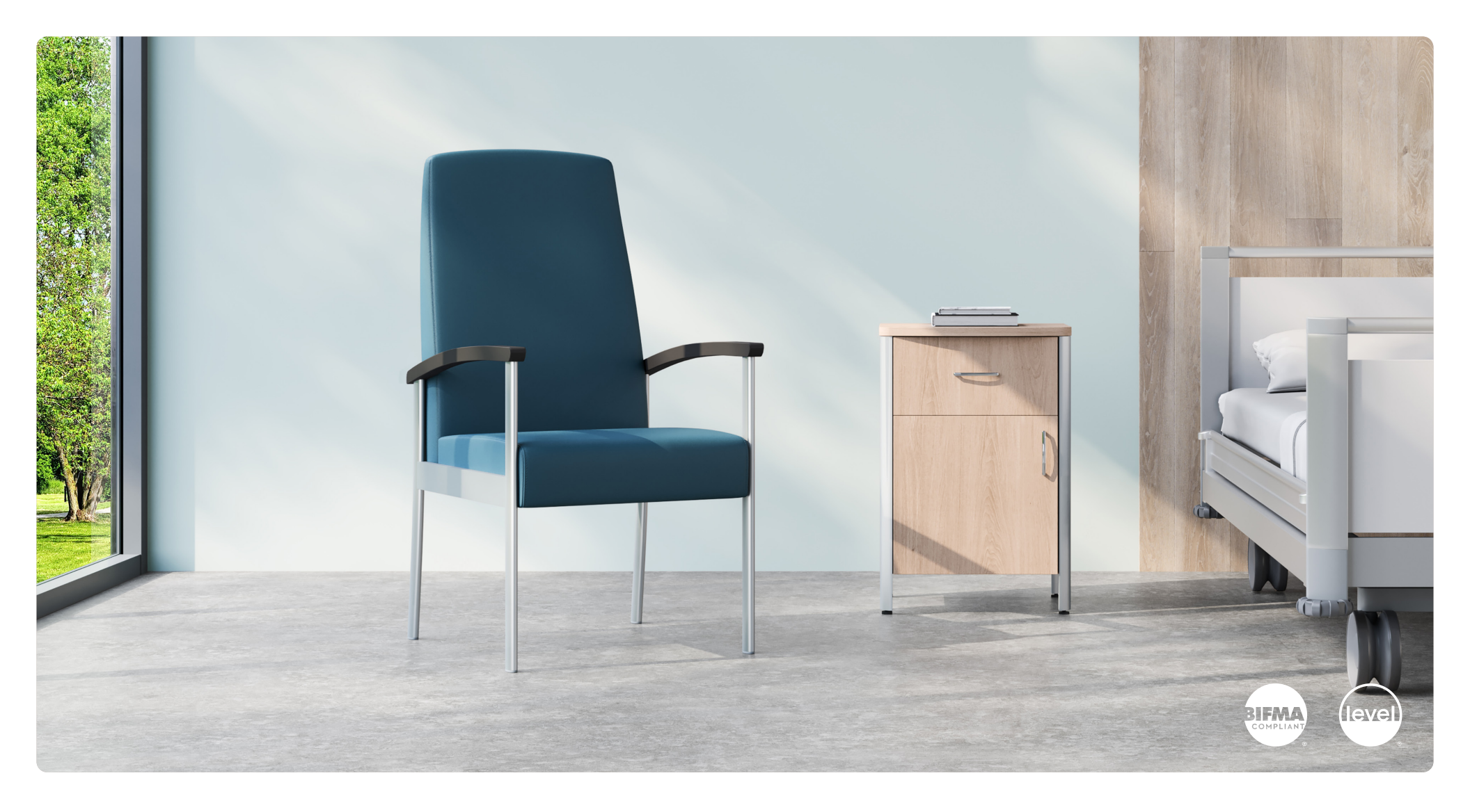
Vista II Highback Patient Seating Collection

Attractive, comfortable and easy-to-clean, the Vista II Patient Chair is designed to improve the healthcare experience through supporting the unique needs of patients, visitors, caregivers and housekeeping staff.