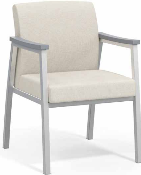
METAL FRAME FINISH –