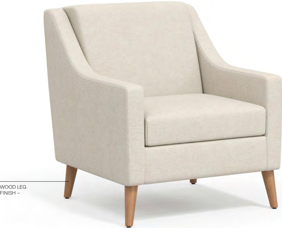
WOOD LEG FINISH -

When ordering this product, specification codes must be added to unit Model Number, as shown below. NOTE: Upholstery and/or additional options must be specified separately.