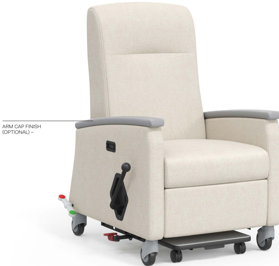
ARM CAP FINISH (OPTIONAL) -