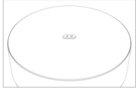
LOCATION FOR 30" ROUND/OVAL TABLES